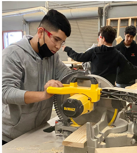
CHS students working on class projects