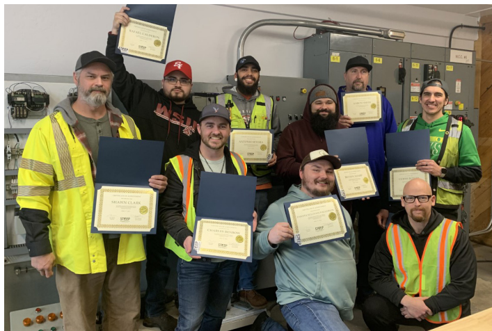
Inaugural STEP class with their completion certificates, April 2023

Program participants currently hold jobs as mill electricians or electrician trainees. By implementing this program SPI is providing crewmembers with skillsets they can take back to each of their mills, each expanding their capabilities to troubleshoot and maintain equipment leading to improved production uptime and ability to work more independently. Over the seven-week course electrical basics, industrial devices, motor control, and PLC’s are covered. An emphasis on troubleshooting is stressed in each of these topics.