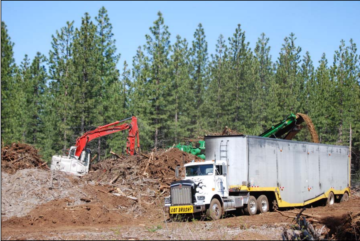
Table 1 lists the equipment utilized to collect, process, and transport biomass fuel to the SPI Lincoln facility.