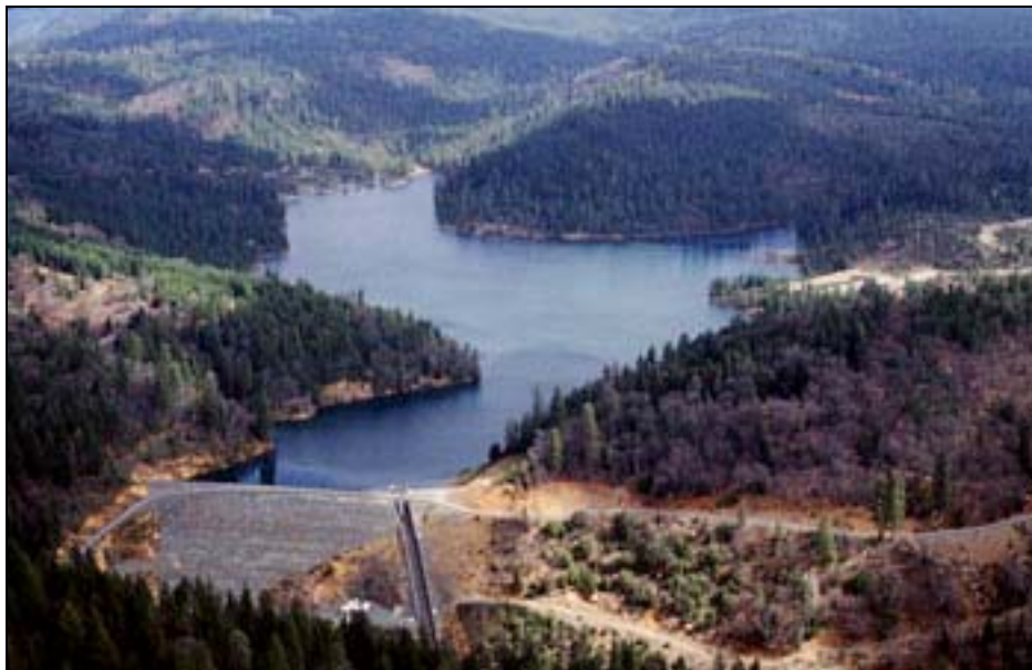
Exhibit 5. Sugar Pine Dam and Shirttail Creek Watershed Near Foresthill, California

Exhibit 5 provides an image of one of the tributaries to the Middle Fork of the American River.