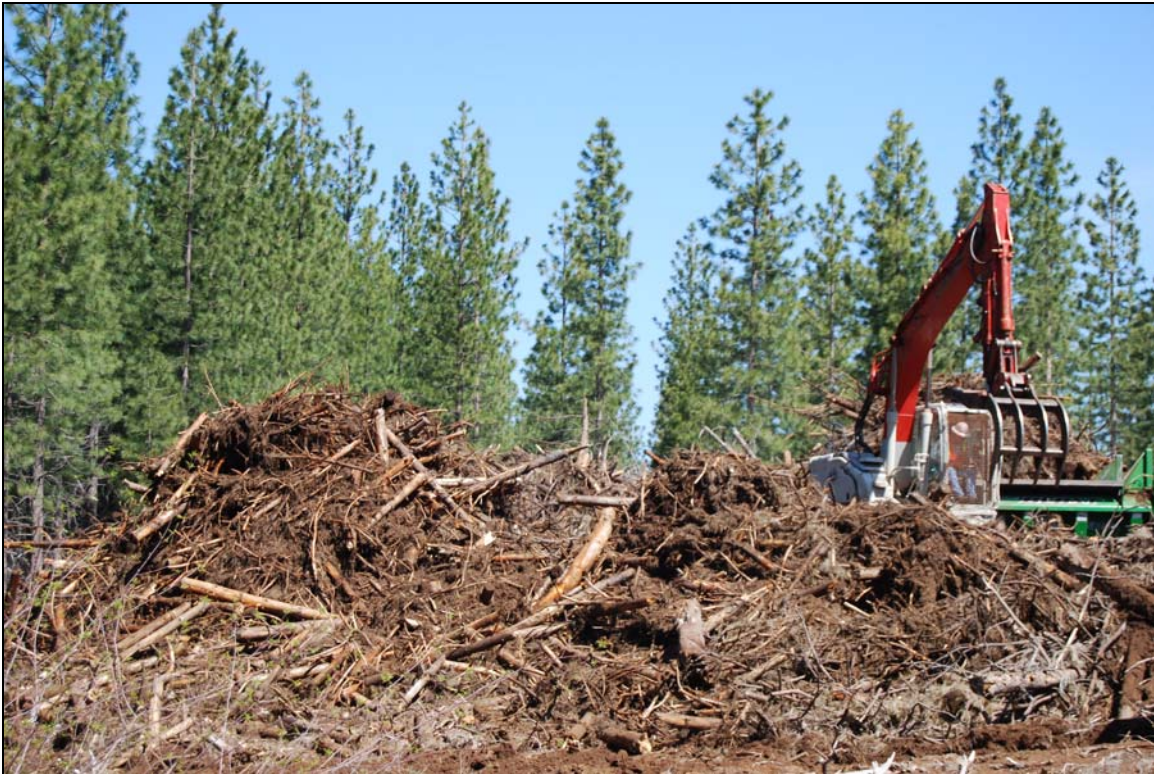
Exhibit 1. Slash Pile at the BFP Project

In order to better forecast the volume and type of recoverable woody biomass material that will be generated during timber harvest activities a general understanding of the timber sale and forest fuels reduction project is important. Outlined below are brief project overviews for each timber harvest project where slash piles were processed and removed as biomass fuel.