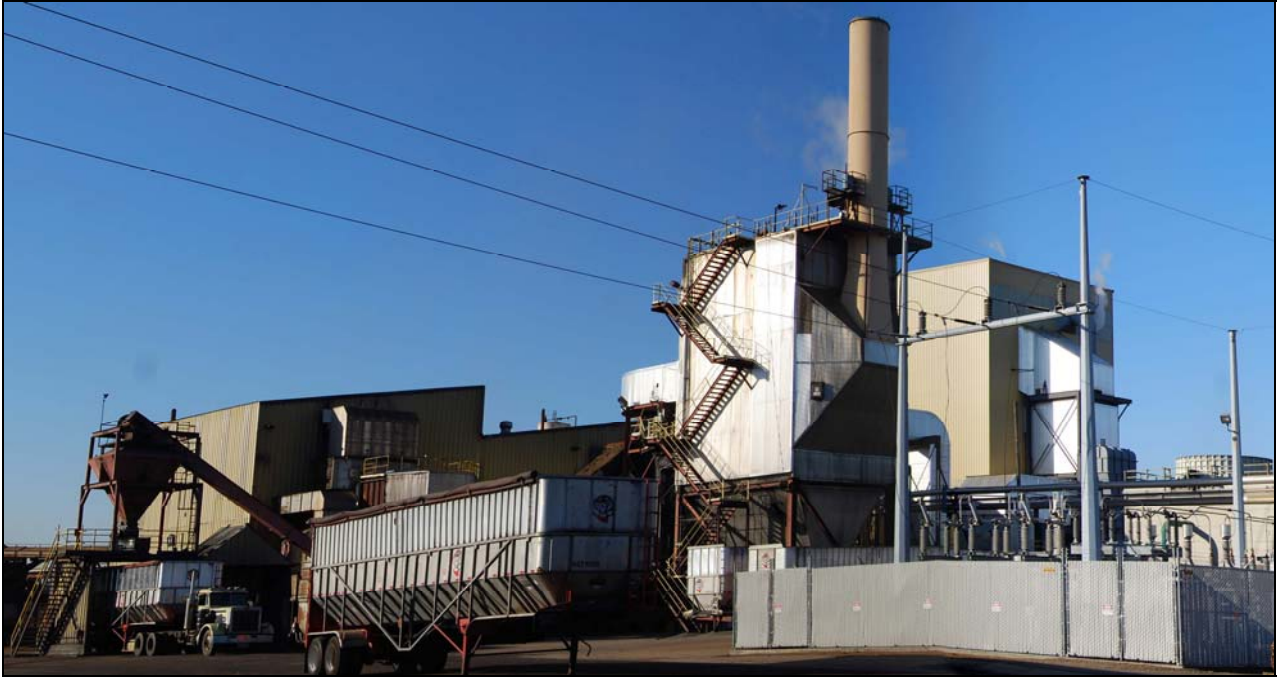
Exhibit 3. SPI – Lincoln Biomass-Fired Cogeneration Plant

The SPI Lincoln boiler produced 4,652 megawatt hours of electricity (MWhe) from the 4,191 BDT of biomass removed by the SSO/BFP projects, as shown in Table 3. This electricity is the equivalent of the annual consumption of approximately 517 single family households.