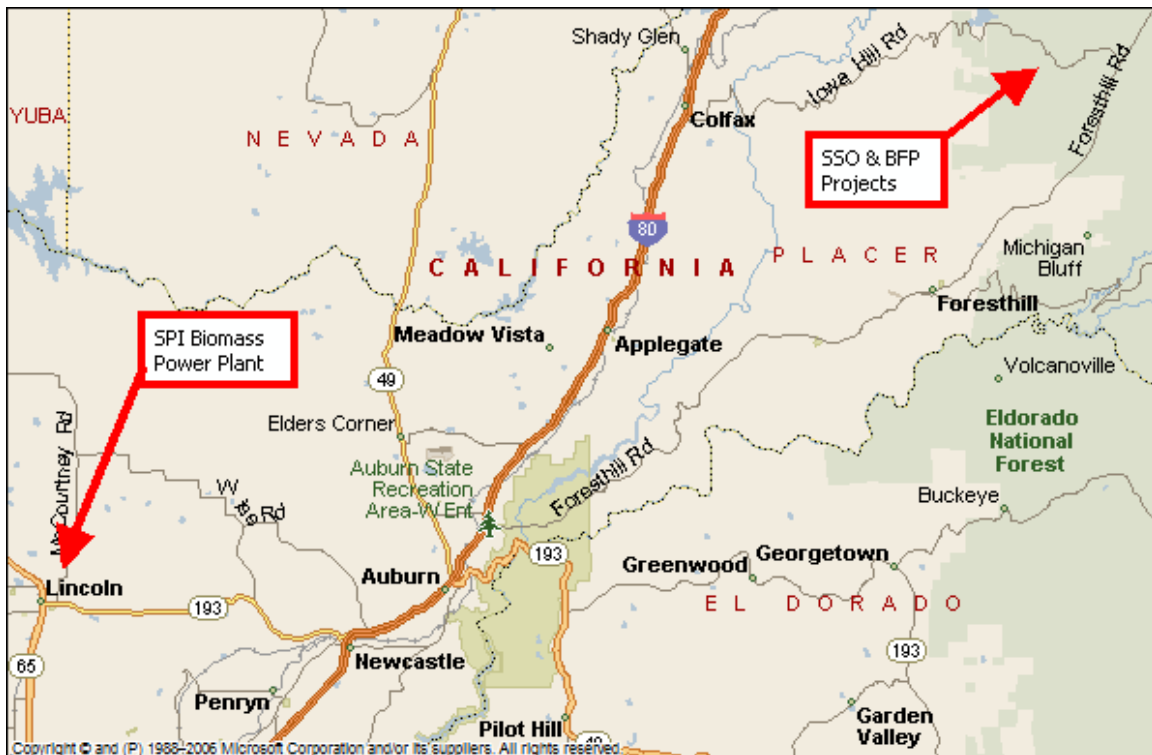
Figure 1. Location of SSO/BFP Projects and SPI Lincoln Facility

Figure 1 highlights the approximate locations of the projects and the SPI facility.