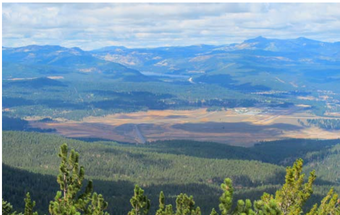
Martis Valley from Martis Peak

TRUCKEE, California -- A unique partnership of local landowners, Martis Valley developers, and Sierra conservationists today unveiled an extraordinary initiative to permanently preserve highly coveted open space in the heart of North Lake Tahoe's Martis Valley.